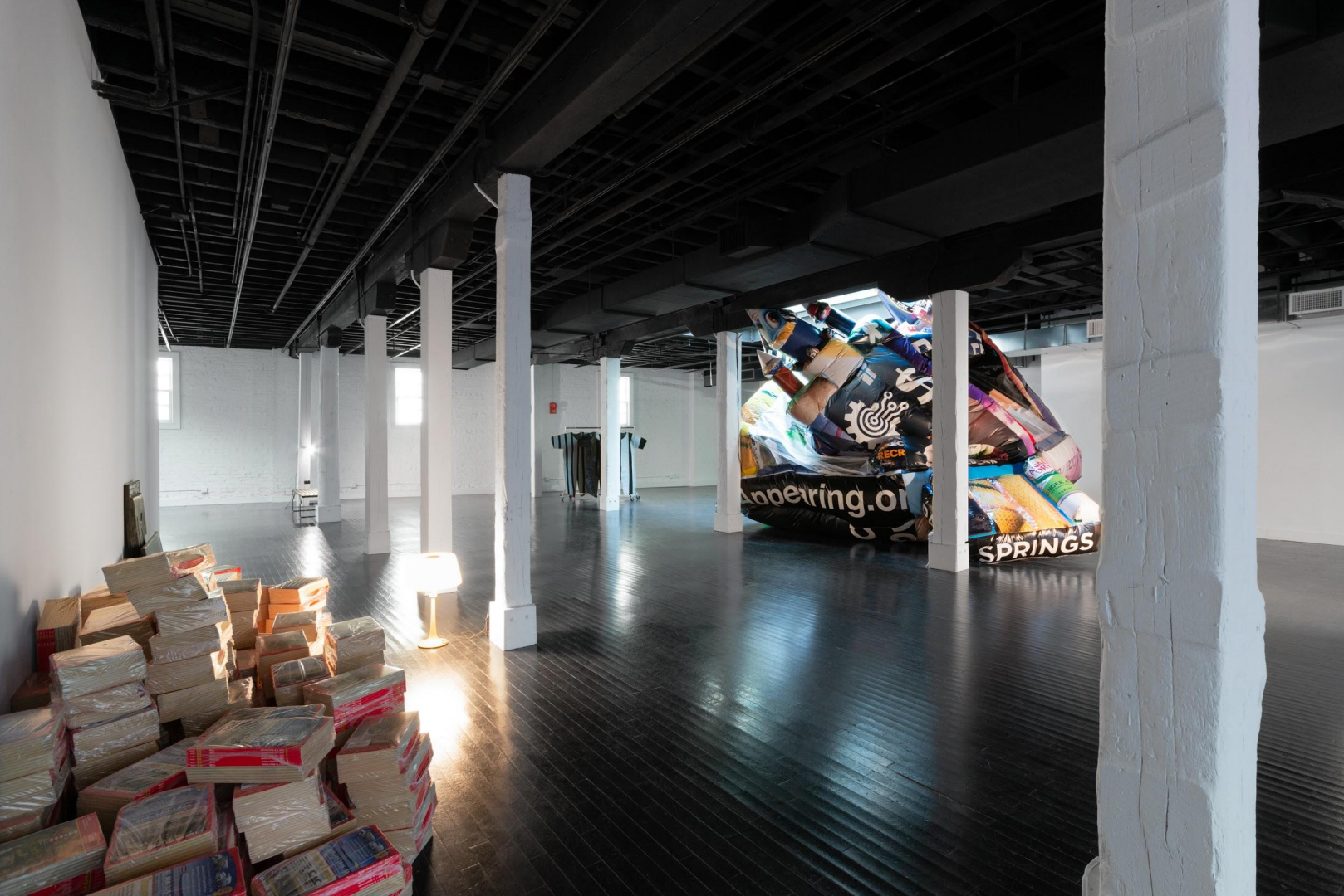
Catharine Czudej HOMEOWNER Installation view