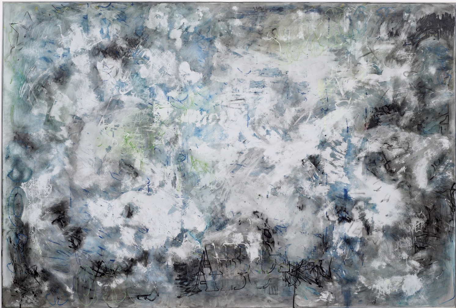
CATHARINE CZUDEJ White Board , 2020 aluminum, oil based marker, enamel 48 x 72 inches