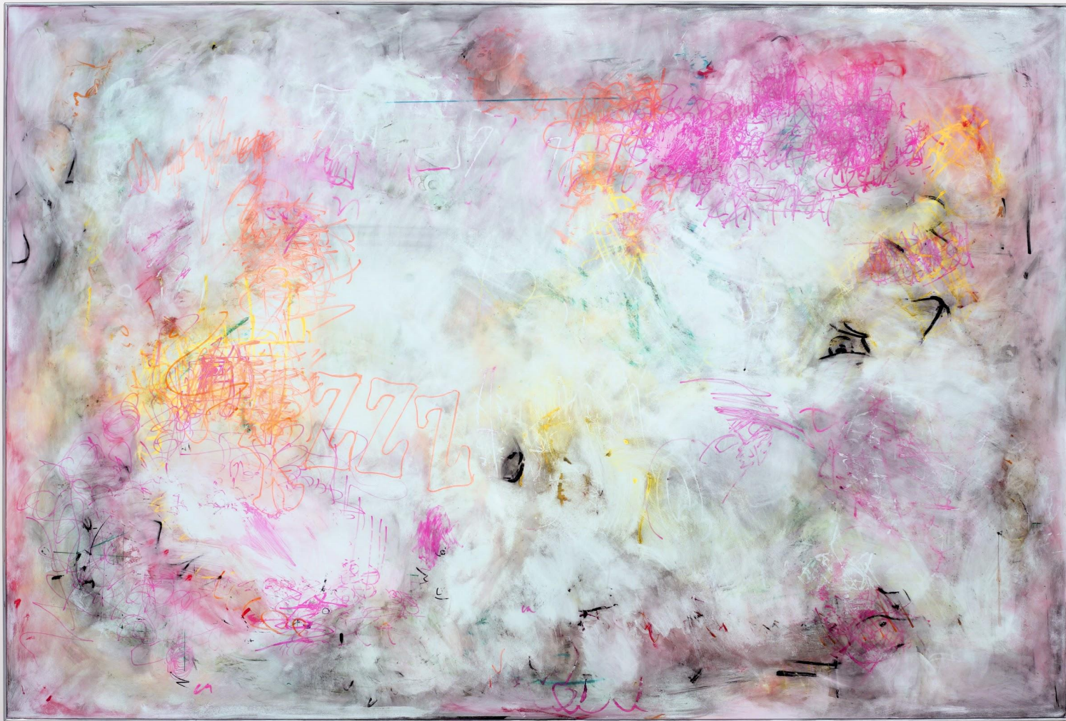
CATHARINE CZUDEJ White Board , 2020 aluminum, oil based marker, enamel 48 x 72 inches