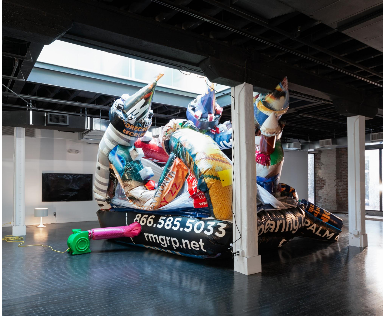
CATHARINE CZUDEJ HOMEOWNER , 2020 vinyl billboards, thread, air blower dimensions variable (maximum scale: 200 x 180 x 200 inches)