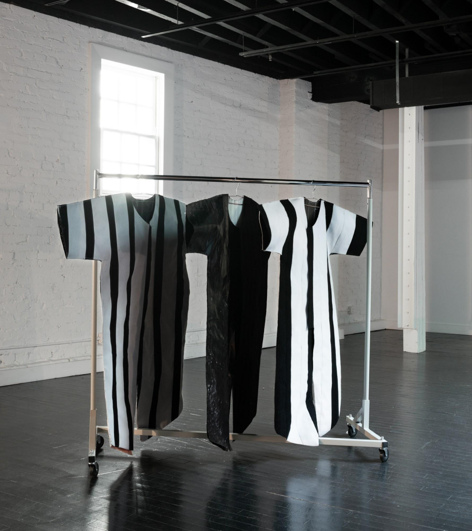
CATHARINE CZUDEJ Don't let the computer get on you, 2020 Velcro, vinyl, steel 64 x 62.5 x 24.25 inches Each suit: 55 x 27 inches