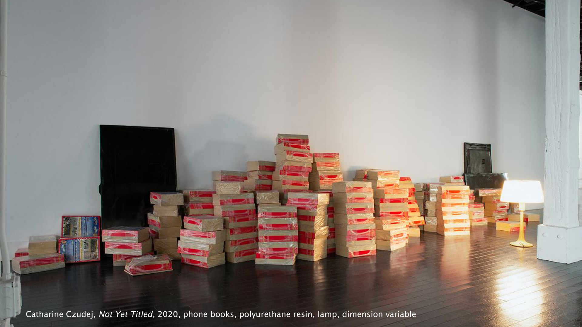
Catharine Czudej, Not Yet Titled , 2020, phone books, polyurethane resin, lamp, dimension variable