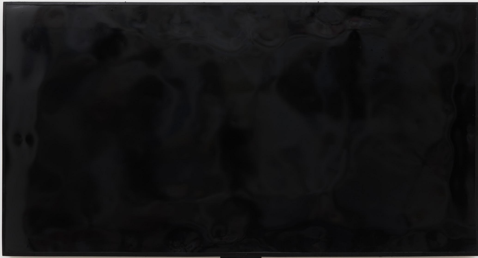
Catharine Czudej TV , 2019 polyurethane resin 38 x 66 x 3 inches