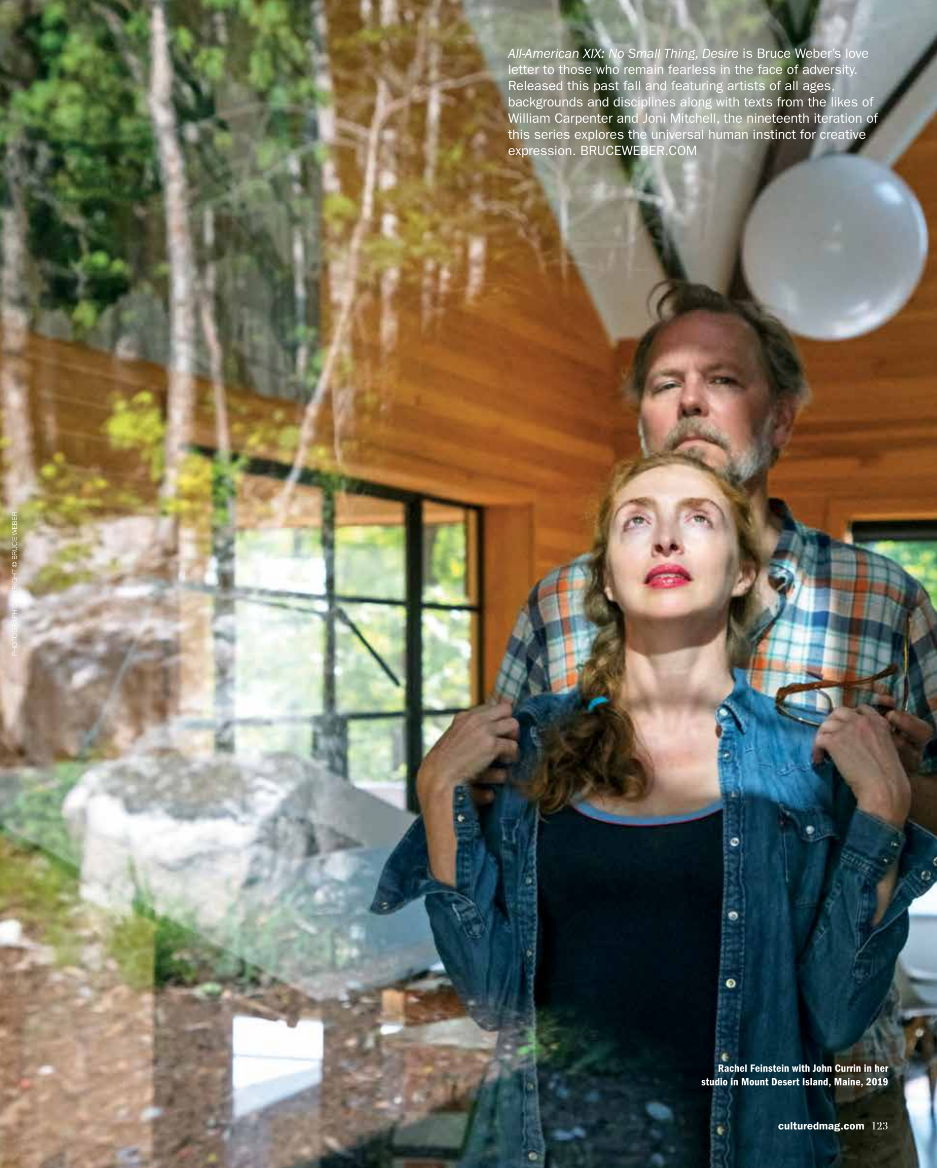
All-American XIX: No Small Thing, Desire is Bruce Weber's love letter to those who remain fearless in the face of adversity. Released this past fall and featuring artists of all ages, backgrounds and disciplines along with texts from the likes of William Carpenter and Joni Mitchell, the nineteenth iteration of this series explores the universal human instinct for creative expression. BRUCEWEBER.COM