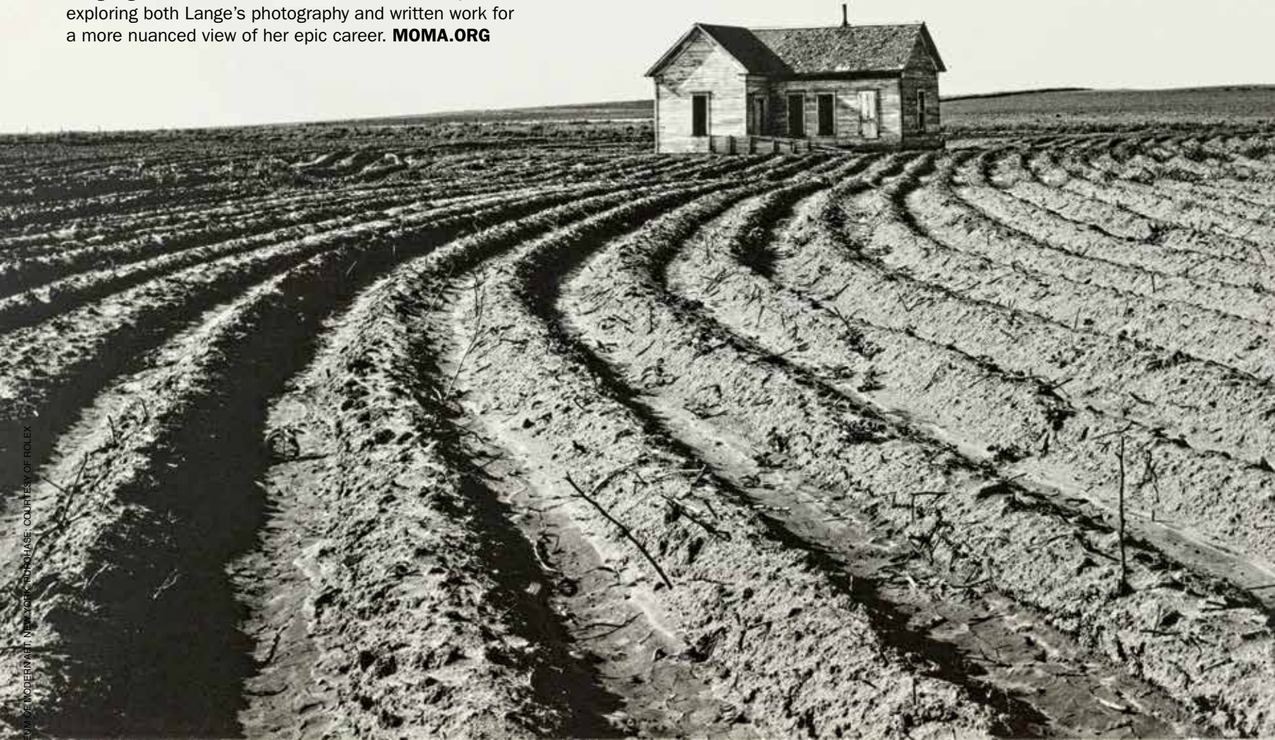
THE MUSEUM OF MODERN ART, NEW YORK CITY