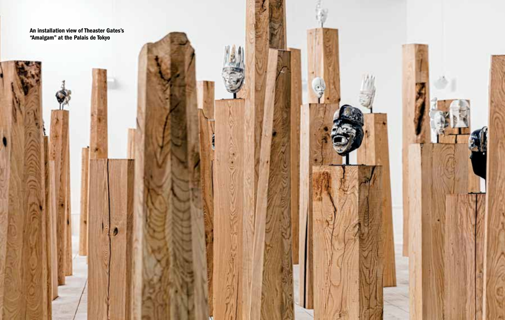
An installation view of Theaster Gates's "Amalgam" at the Palais de Tokyo

Follow Theaster Gates as he takes his unique blend of social activism and art to the UK for the first time. Opening at Tate Liverpool this December, the focal point of "Theaster Gates: Amalgam" is the removal of people of mixed ethnicity from Malaga Island in the early 20th century. Through sculpture, installation, film and dance, Gates's work takes on this history. TATE.ORG.UK